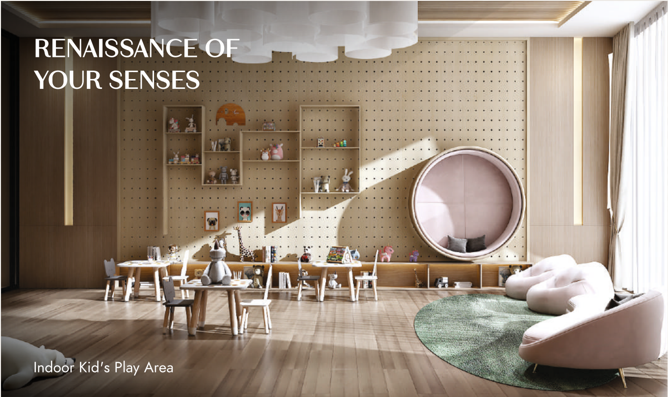
Indoor Kid's Play Area